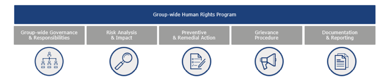
Graphic 1: The five building blocks of our Human Rights Program

Our human rights due diligence – for our own operations and supply chains – is based on five building blocks: